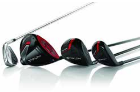
TaylorMade Stealth Family