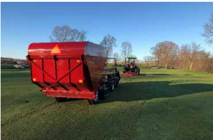
Fairway verticutter w/ vacuum following

On April 16th and 17th we conducted our spring tee aeration and heavy fairway verticutting. This process went extremely well as we continue our battle against the build-up of thatch. Tee aeration consisted of \frac{3}{4} " hollow tines at a 2.5" spacing, light verticutting to break up cores, dragging to reincorporate good sand, removal of thatch core, and blow. Throughout the year we will continue with monthly verticutting to minimize additional accumulation of organic material. Heavy fairway verticutting consisted of \frac{3}{4} " deep verticutting, followed by vacuuming up thatch, and finishing up with a complete blowing. Once finished with the fairways, we must send a small crew out to pick up each pile and blow remaining material into the woods.