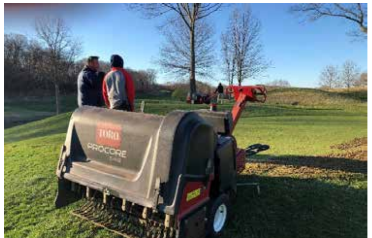
Tee aeration in progress