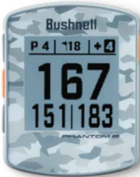
BUSHNELL PHANTOM 2 GPS $129.99

ENJOY THE EASE AND CONVENIENCE OF GETTING GPS-PROVIDED DISTANCES AROUND THE COURSE WITH THE PHANTOM 2. IT FEATURES LARGE, EASY-TO-READ FRONT, CENTER AND BACK DISTANCES, AN INTEGRATED BITE MAGNETIC MOUNT AND GREENVIEW WITH MOVABLE PIN PLACEMENT.