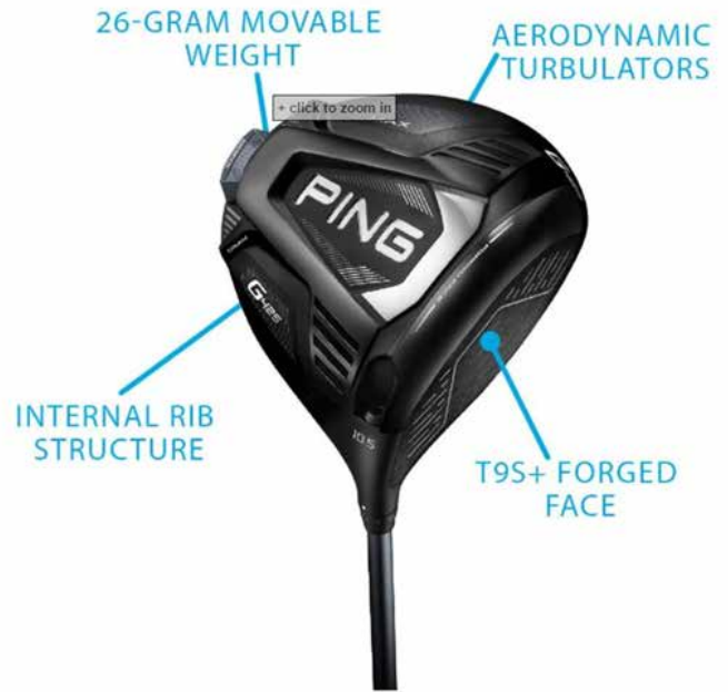
PING G425 MAX DRIVER $499.99

ENJOY THE EASE AND CONVENIENCE OF GETTING GPS-PROVIDED DISTANCES AROUND THE COURSE WITH THE PHANTOM 2. IT FEATURES LARGE, EASY-TO-READ FRONT, CENTER AND BACK DISTANCES, AN INTEGRATED BITE MAGNETIC MOUNT AND GREENVIEW WITH MOVABLE PIN PLACEMENT.