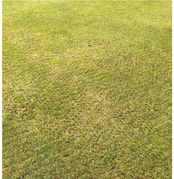
New Seedlings Filling In Thinned Out Area