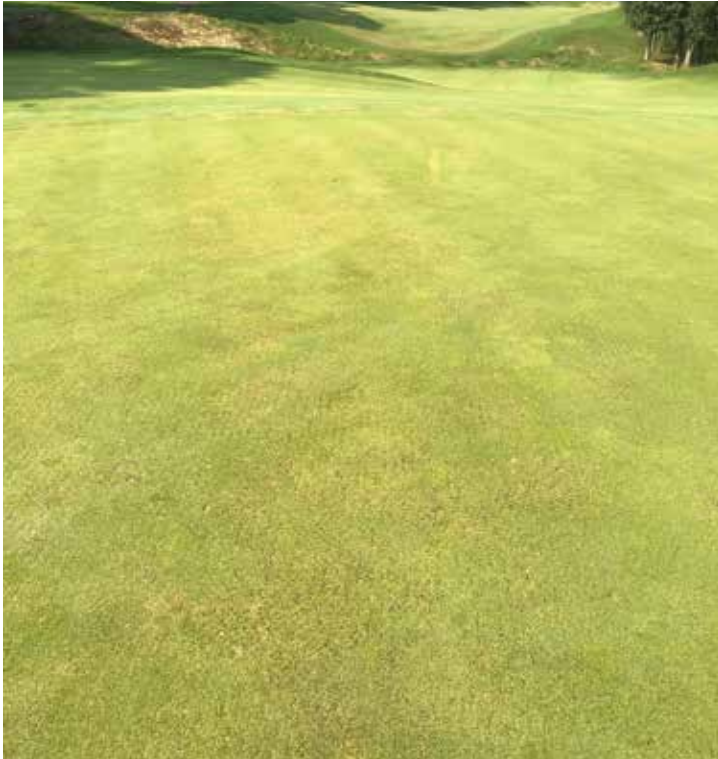
#12 Green Starting Recovery Process

cultural programs we have been working so hard to incorporate are paying off as two of our worst greens from last year (8,14) have been performing very well and the others are still healthy. This is another example of how our cultural programs must continue to be done for the next couple of years regardless of how things look on the surface. The recovery efforts are well under way as thinned out areas have been spiked, seeded, fertilized and treated with a fungicide to prevent what is known as damping off. Monitoring moisture over the next few weeks is going to be very important as we want to give the young seedlings enough moisture to survive, but not too much that we feed any fungi. Seed was incorporated on 7/23 & 7/24 and we already have holes full of new growth. If everything continues to go as expected and the weather decides to cooperate just a little, we should be in much better shape by September 1st.