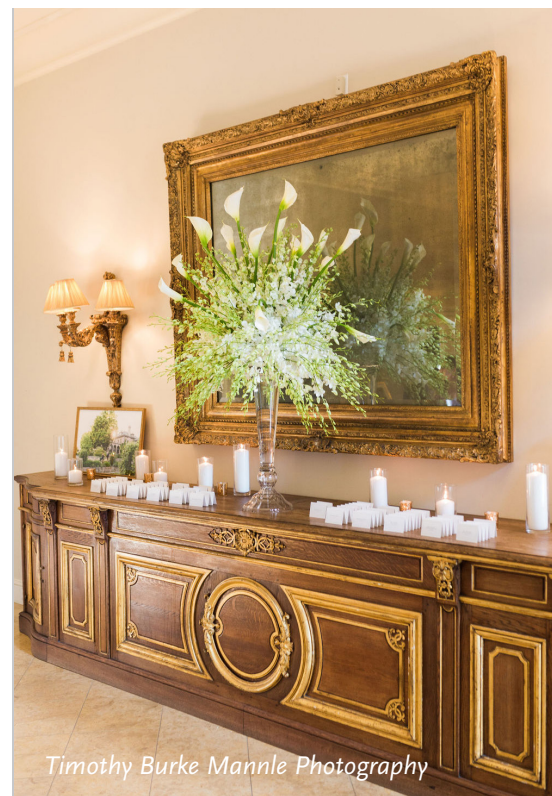
Timothy Burke Mannle Photography