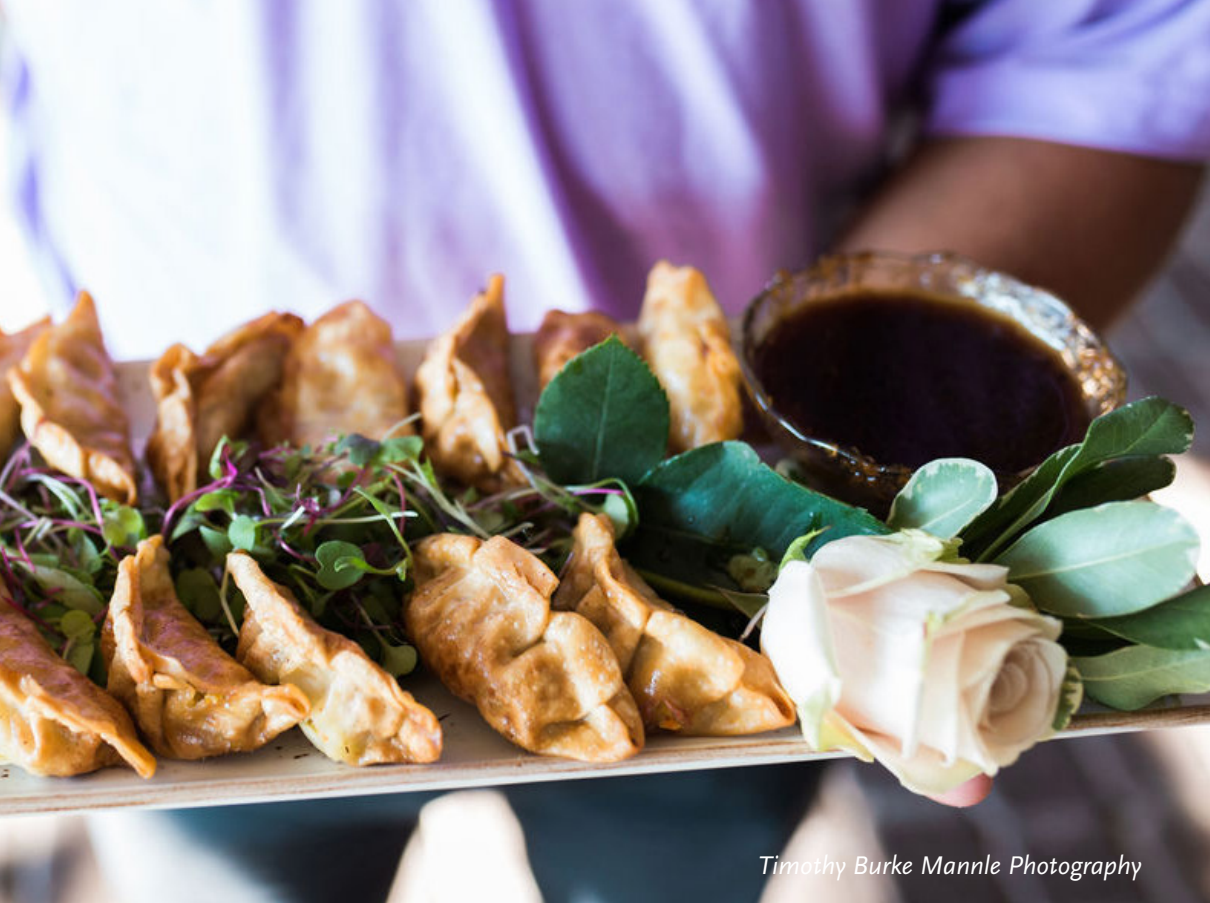
Timothy Burke Mannle Photography