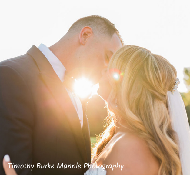
Timothy Burke Mannle Photography