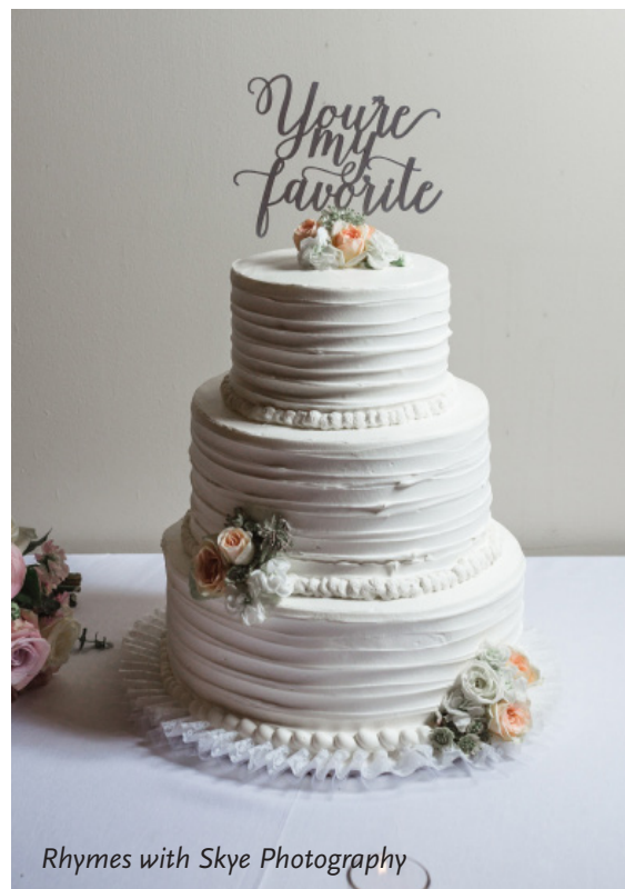
Rhymes with Skye Photography